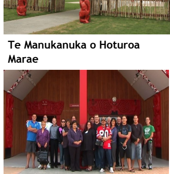
Te Manukanuka o Hoturoa Marae