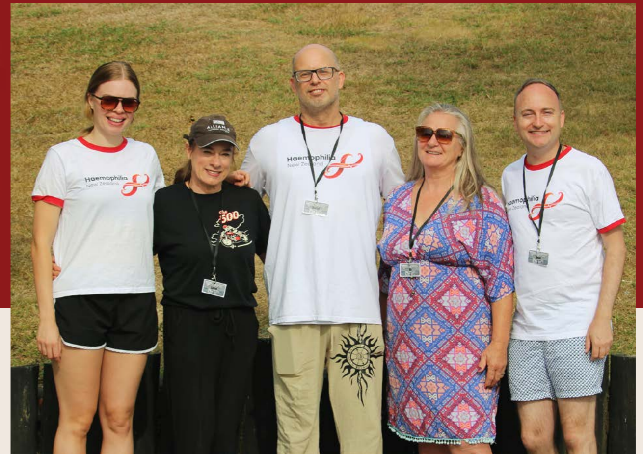
Some of the team at national family camp

Community outreach has been another important aspect of my work. I provided education for several schools where members attend, offering information, answering questions, and giving advice and reassurance to staff on how to support their students with bleeding disorders. I also sourced and provided free tickets to various family shows and events including Kids Big Day Out, Razzamatazz, Armageddon, and more.