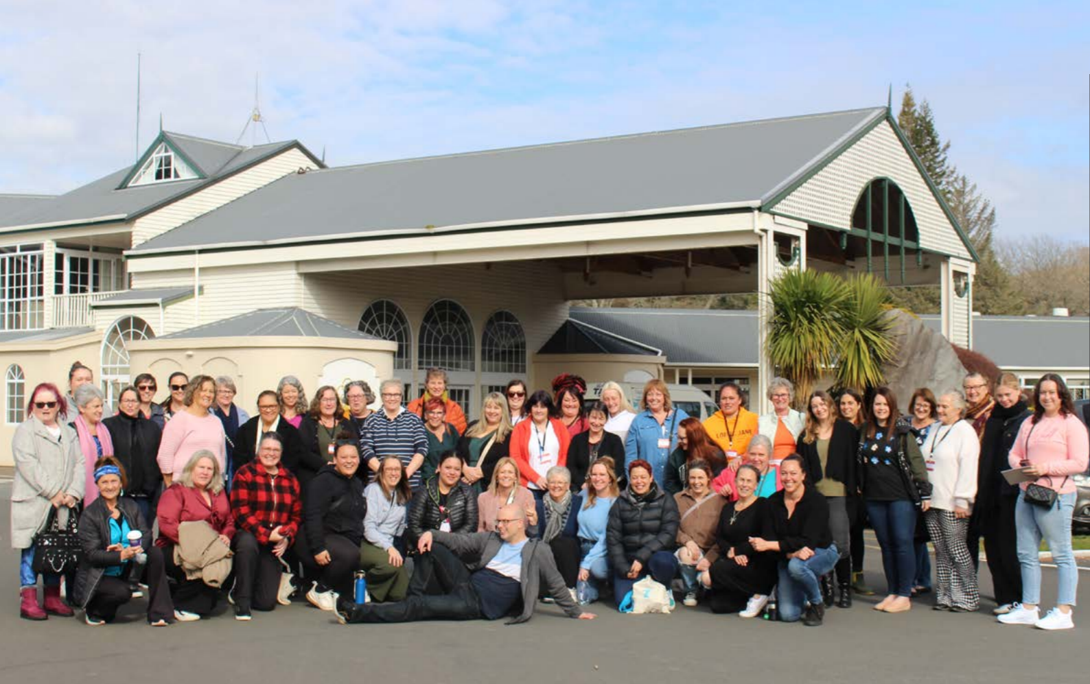
Women's wellness weekend attendees, Taupō, July 2025

and other bleeding disorders. Their sessions prompted valuable questions and discussions, and they joined Lauren on an expert panel that allowed women to reflect and ask follow-up questions.