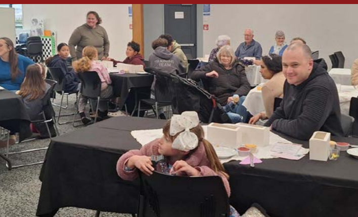
Central members at its AGM