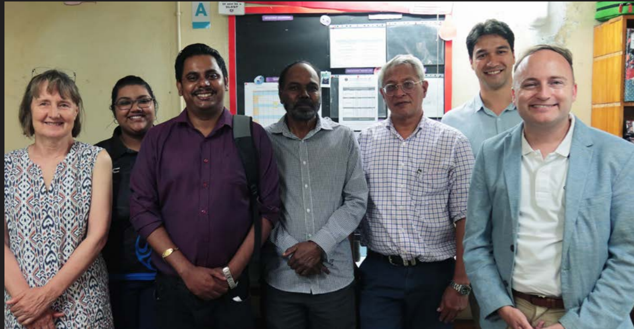
The Fiji Haemophilia Foundation and HNZ twinning teams at a lab visit, Nadi, December 2024

...I have taken up the position with a renewed focus on how we can strengthen our organisation and what positive impact we can continue to make on the lives of all people affected by bleeding disorders.