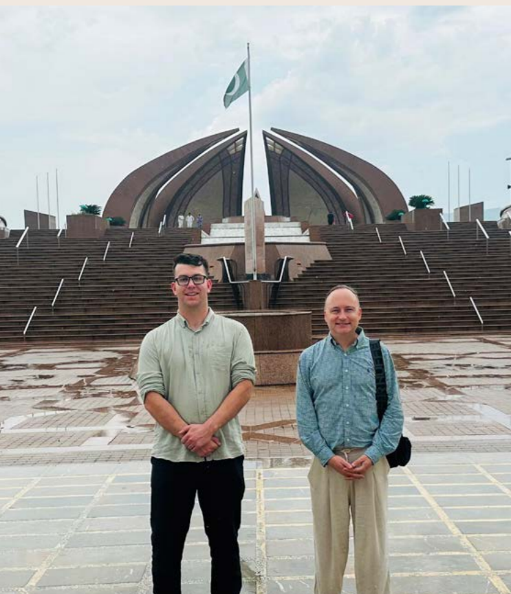
Pakistan Youth Twinning Assessment, Islamabad, November 2024

...I have taken up the position with a renewed focus on how we can strengthen our organisation and what positive impact we can continue to make on the lives of all people affected by bleeding disorders.