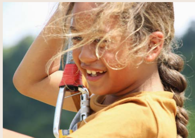
Family camp, Ngāruawāhia, February 2025

Team building and professional development events focused on colleague relationship building, with activities designed to help team members learn each other's strengths and improve collaborative service delivery. These internal events were supported by ongoing external supervision sessions, ensuring that the quality and effectiveness of member support services continued to develop and improve throughout the year.